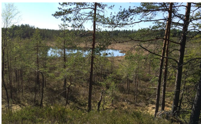
Lomtjärnen.