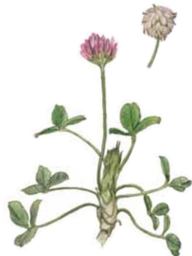
Strawberry clover Trifolium fragiferum