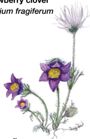
Pasque flower Pulsatilla vulgaris