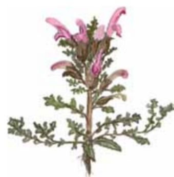
Lousewort Pedicularis sylvatica

Strawberry clover and sea plantain grow near the sea, on areas which are more saline; pasque flower grows where it is dry and lousewort where it is damp. What they have in common is that they are all dependent on grazing animals which stop the coastal meadows from becoming overgrown.