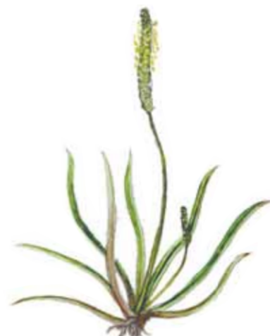
Sea plantain Plantago maritima