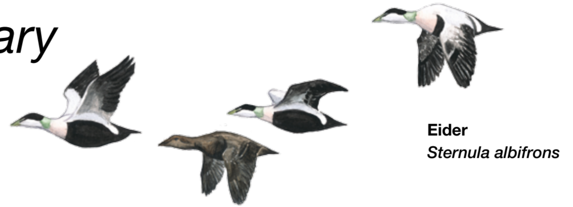
Eider Sternula albifrons

The tall marram grass has an incredible ability to stabilise drifting sand. It can grow through more than a metre of sand in one year and stabilises the sand into dunes, known as white dunes. Further inland, there are older grey dunes with mosses, lichens, shorter grasses and herbs. The grey dunes then develop into dune heaths with heather and crowberry as the typical species. These nutrient poor coastal areas, where dry heaths mixed with damper dune wetlands and saline coastal meadows, have been used for grazing for hundreds of years. They were a part of what was once Kulla Fäläd; a large communal grazing area which stretched from north Öresund to Skälderviken. Remains of this old common can be found for example at Rönnen and between Jonstorp and Farhult.