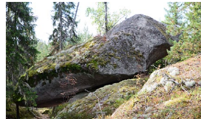
The rock 'Lockstenen'

A relatively easy walk with the exception for a number of challenging sections ascending to and descending from Suggan. Once you are at the 'Suggan's' smooth rocks (approx. 140 metres above sea level.) you have a breathtaking view of the Järle river valley, Järle peat bog and all the way to Frövifors. Bring your binoculars and enjoy some birdwatching. From the trail you can also climb up to the Källartjyvens cave and the boulderous area with block caves at several levels, which are known as 'Trappstegsgrottorna' (literally: the Step Caves). Also worth visiting is the mighty 'Lockstenen', a rock which balances over the trail to the south of 'Suggan'.