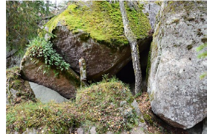
The cave 'Carlannersagrottan'

A sporadically very hilly trail that, particularly in the eastern parts, can be challenging and hard work. On the heights you will encounter barren flat rocky terrain, where only pine trees can thrive, while the lower sections have more fertile coniferous forestland. Take a peek inside the area's largest block cave: 'Carlannersagrottan'. From 'Stenmannens tron' ('the stone man's throne'), a rock formation ideal for sitting on, the trail becomes very steep. Please observe there is a risk of slipping when conditions are wet or icy. Once inside the spruce forest, at 'Kolbottna', you will find remnants of an early charcoal production facility: charcoal beds and the ruins of a former charcoal burner's hut.