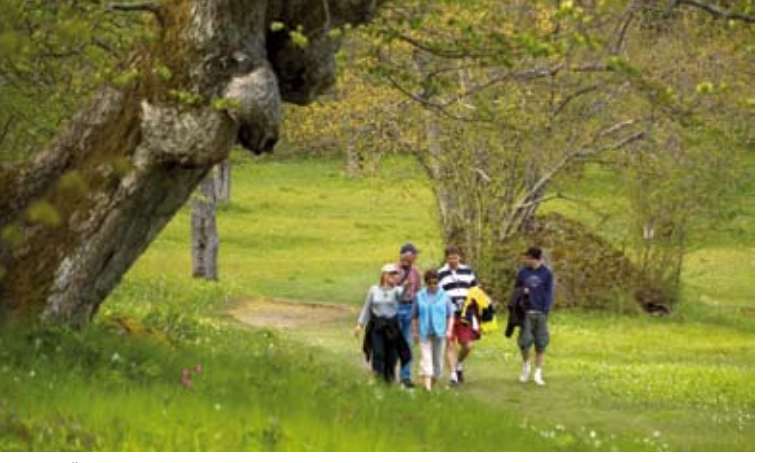
Ängsö has many visitors and is known for its ancient landscape with flower-rich meadows, leafy deciduous woods and idyllic crofts.