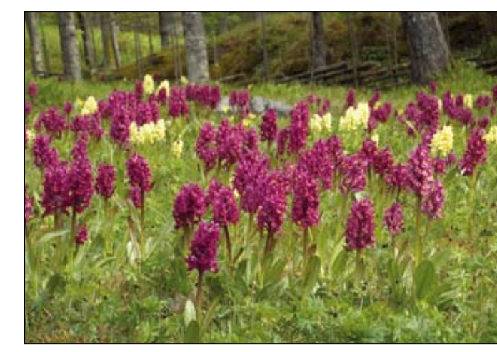
Elder-flowered orchids Dactylorhiza sambucina

There is no shop, restaurant or accommodation on the island.