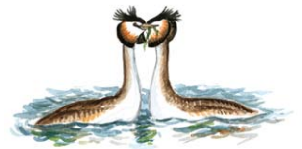
A couple of great crested grebes Podiceps cristatus displaying their courtship ritual.

The Hemviken bay has one of the largest populations of great